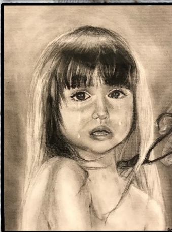
Art Exhibit Created By Students From Arborg Collegiate